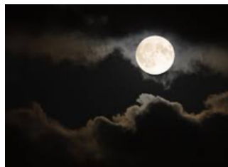
Leo Full Moon

Recommendation for this very weekend in time and space: "Let the Sunshine In"