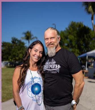
Frequency 432 Healing + Wellness Expo!

WOW! What an INCREDIBLE EVENT with such AMAZING People! Thank you to all who came!